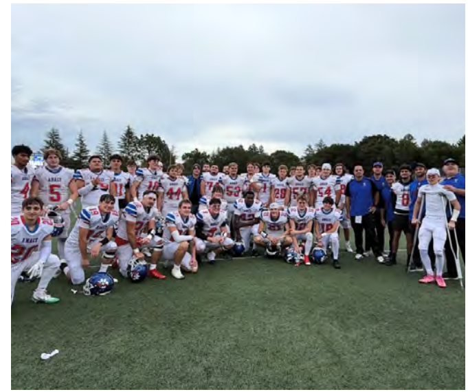
Analy High School 2025 Varsity Team.

But due to more mental strength, the opening loss would not affect the team too much, as they went on to win 4 games in a row, finishing non-league play 4-1! The Tiger victories included the visiting Napa Grizzlies, 56-35, and the Petaluma Trojans, where in a close game, the Tigers snuck away with a thrilling upset for the first time in 3 years, 52-49. Many seniors said that win against Petaluma would go down as their favorite memory from the season, and even their football careers. Week 4, the Tigers hosted the visiting Piner Prospectors, determined to avenge last year's 1 point loss. The Tigers did not disappoint, and won the home thriller 49-7. Their roll would continue, as another revenge game was coming in Week 5, when they played the Kimball Jaguars at Carlson Field. In 2024, the Tigers lost a rough game 72-14, and this year, the outcome was very different. Going into halftime, the Tigers were down, but with a hard fought second half, the Tigers pulled off another upset, and left that night with a 48-34 win.