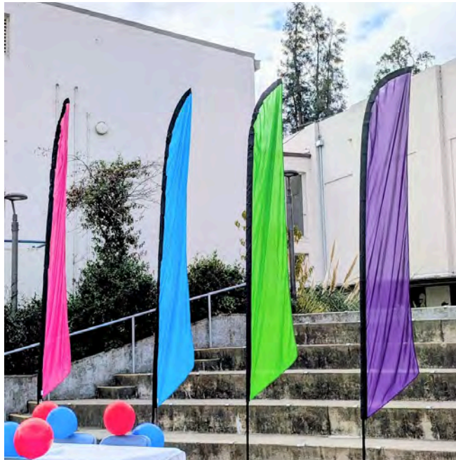
Flags fly the colors of the four houses - Ignis, Lagooz, Terra, and Aether - during lunch.

Teacher Participation: Not everyone is going to agree with this system or be willing to participate. For teachers specifically, this raises problems. Students will reflect the ideas of their teachers – and that should be okay. While it is amazing there are select teachers willing to set up and coordinate the houses, it is not a bandwagon, and not everyone should be required to be on to be considered "there for the students". If the house system is to be drama free, let everyone, teachers or not, choose their own rate of participation in and regarding the Analy High School Houses.