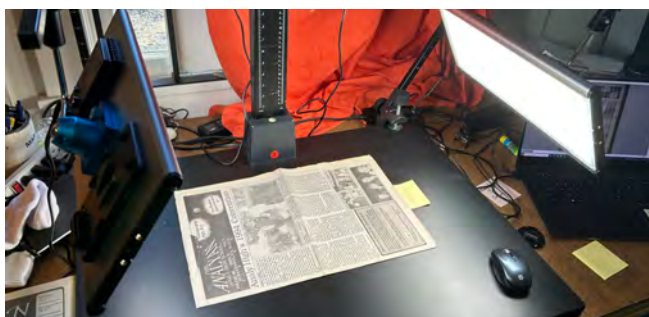
The special digitization equipment used to scan and preserve the old student newspaper.

The Analy Newspaper is and always has been a vital part of our community. It holds countless students' voices, opinions, and dreams. And by reading and understanding our past, we can prepare ourselves for the future.