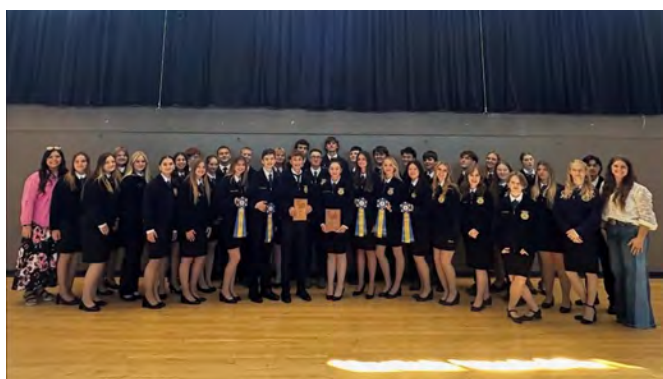
Sebastopol FFA Opening/Closing Contest.