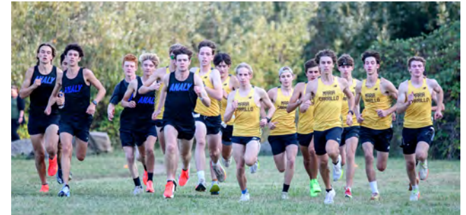
Analy's Varsity Boys at the start of a race.

Through hard work and dedication, this year's Analy Cross Country team became one of the most accomplished in school history.