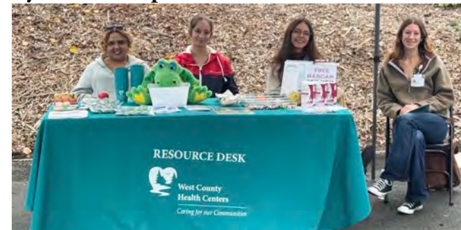
West County Health Center + West County Teen Clinic representing at Guerneville Elementary School Community Engagement Fair