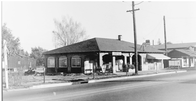
A historical image of the train depot that now houses the West County Museum.